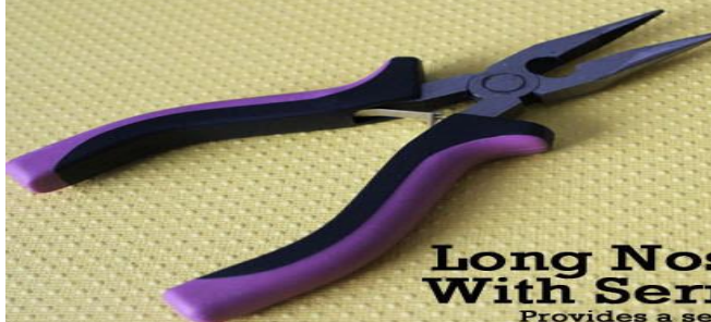
Long Nosed Pliers With Serrated Tips Provides a secure grip when holding onto jewelry pieces or wire.