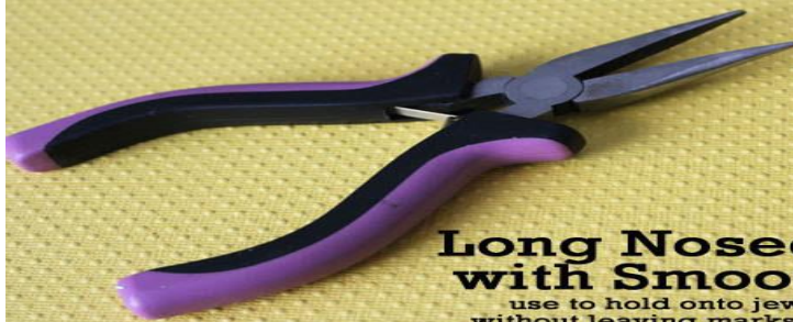
Long Nosed Pliers with Smooth Jaws use to hold onto jewelry pieces, without leaving marks on soft metals.