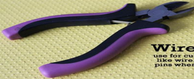
Wire Cutters use for cutting metal pieces like wire, chain, and head pins when making jewelry.