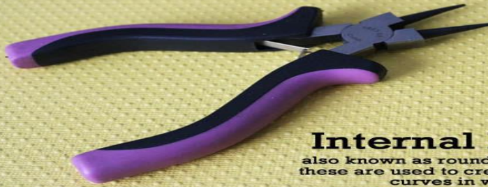
Internal Pliers also known as round-nosed pliers these are used to create loops and curves in wire.