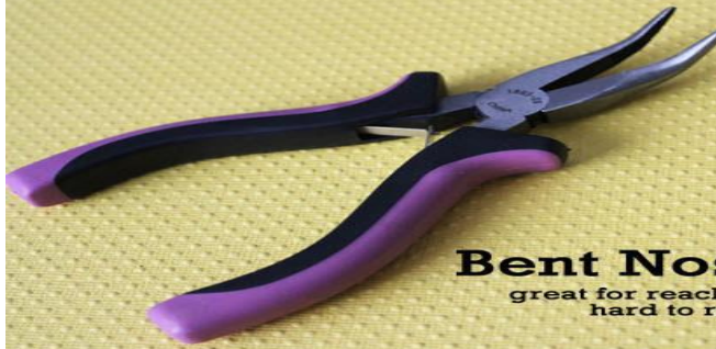
Bent Nosed Pliers great for reaching into tight and hard to reach places.